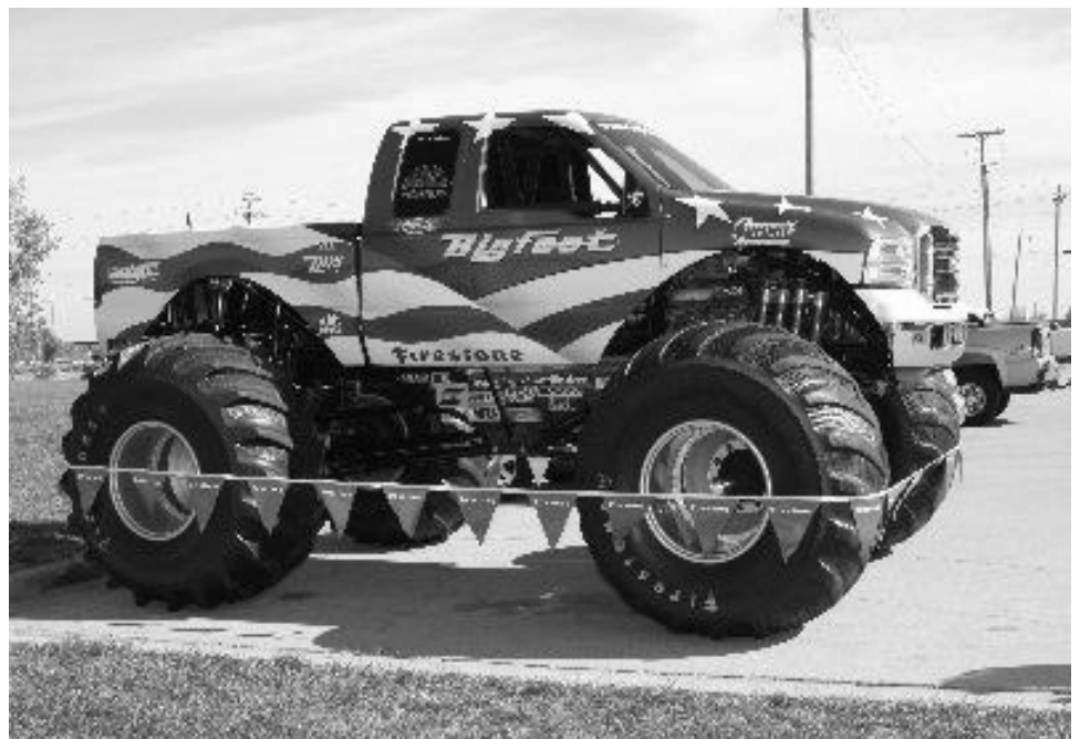
Bigfoot #12 showed up at the event on Sunday.