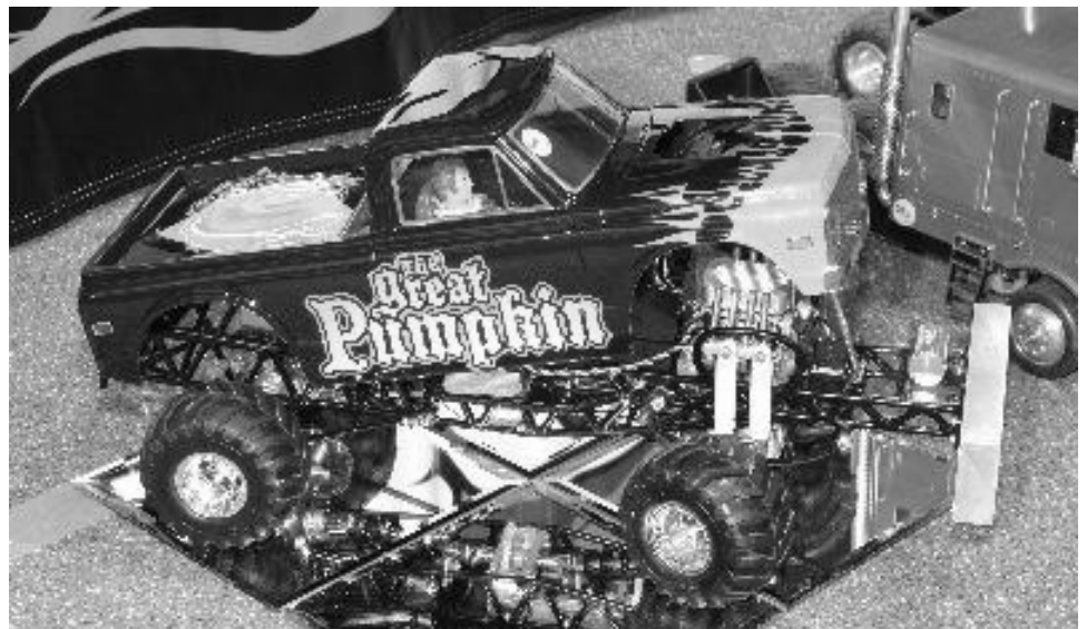
Above; Pulling Concourse, Presidents Award, and Best Engineered Puller award winner